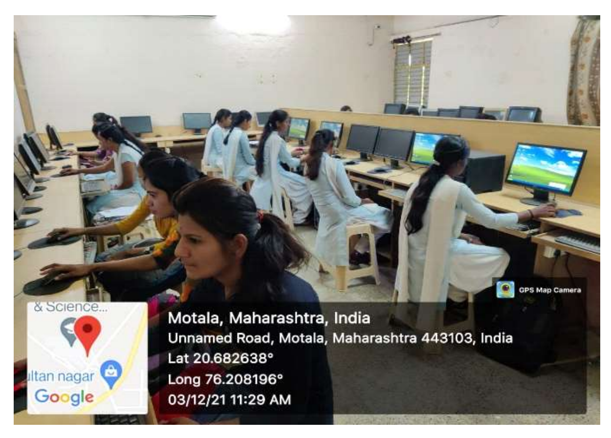
Students engaged in the computer room of the college.